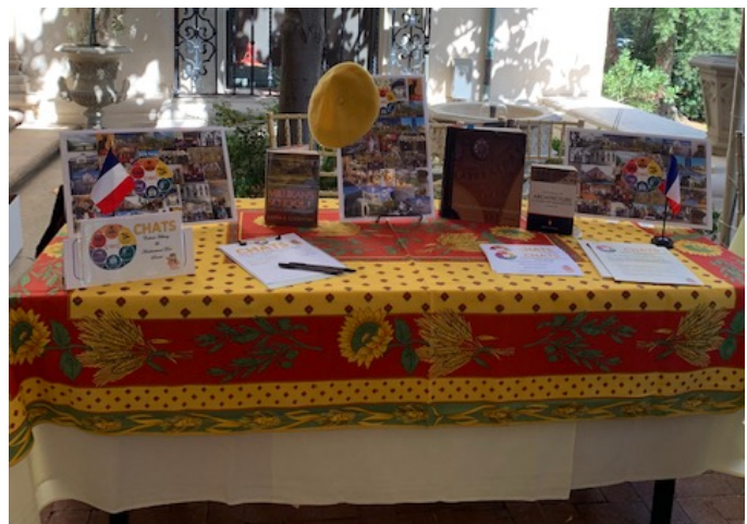
Figure 4: CHATS table at the 2019 CWC Fair

Email us at chats@cwccaltech.org if you are interested!