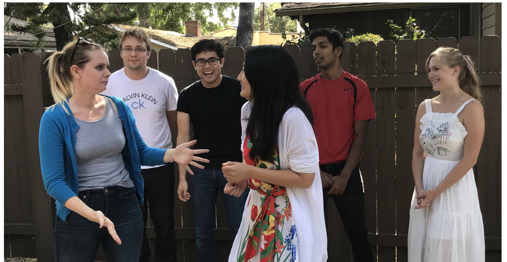
Caltech's improv troupe IMPLiCIT performed short skits.