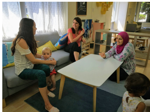
CWC Playgroup inside the Casita

The CWC owns a ViewSonic projector. If your activity group or program chair would like to borrow it for a presentation or an event please contact Vilia Zmuidzinas at viliazm@gmail.com . It can be signed out for up to one week at a time.