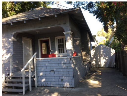
Figure 1: Casita Exchange - new tent location