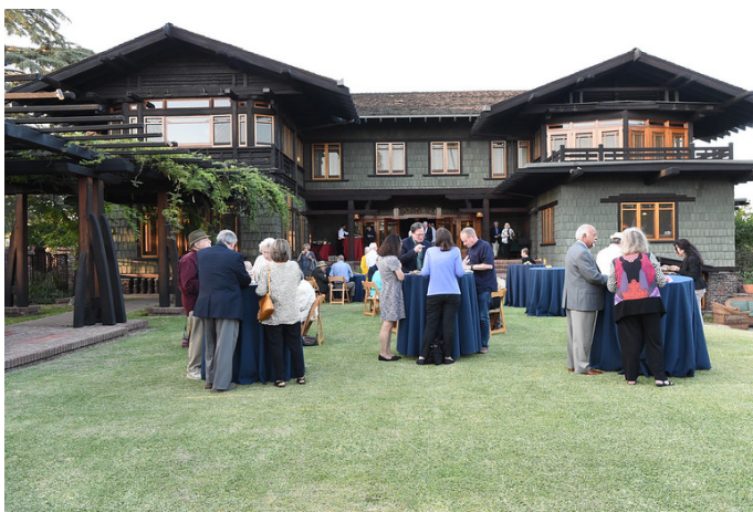
Figure 2: Blacker House

This season, each M&M concert, presented by PCM, is inspired by a book with a musical subject. The concert program presented on October 13, 2019, was inspired by The Cellist of Sarajevo, by Steven Galloway.